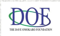
Dave Omokaro Foundation